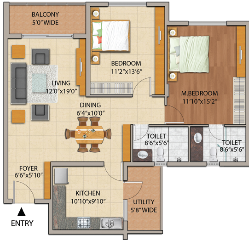
TYPE B4 2 BHK