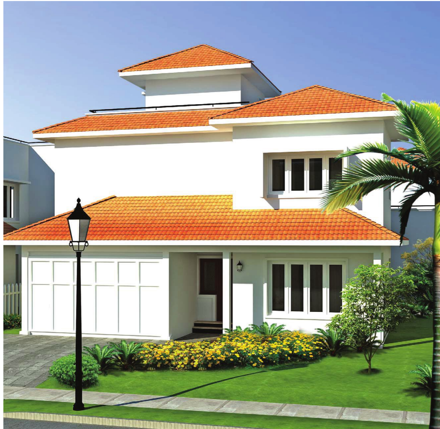
VILLA TYPE A-1