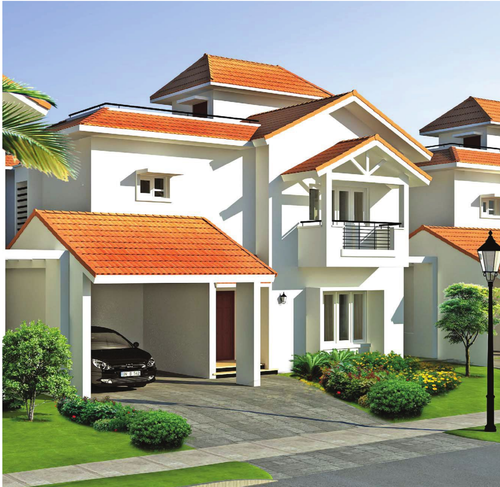
VILLA TYPE B-2