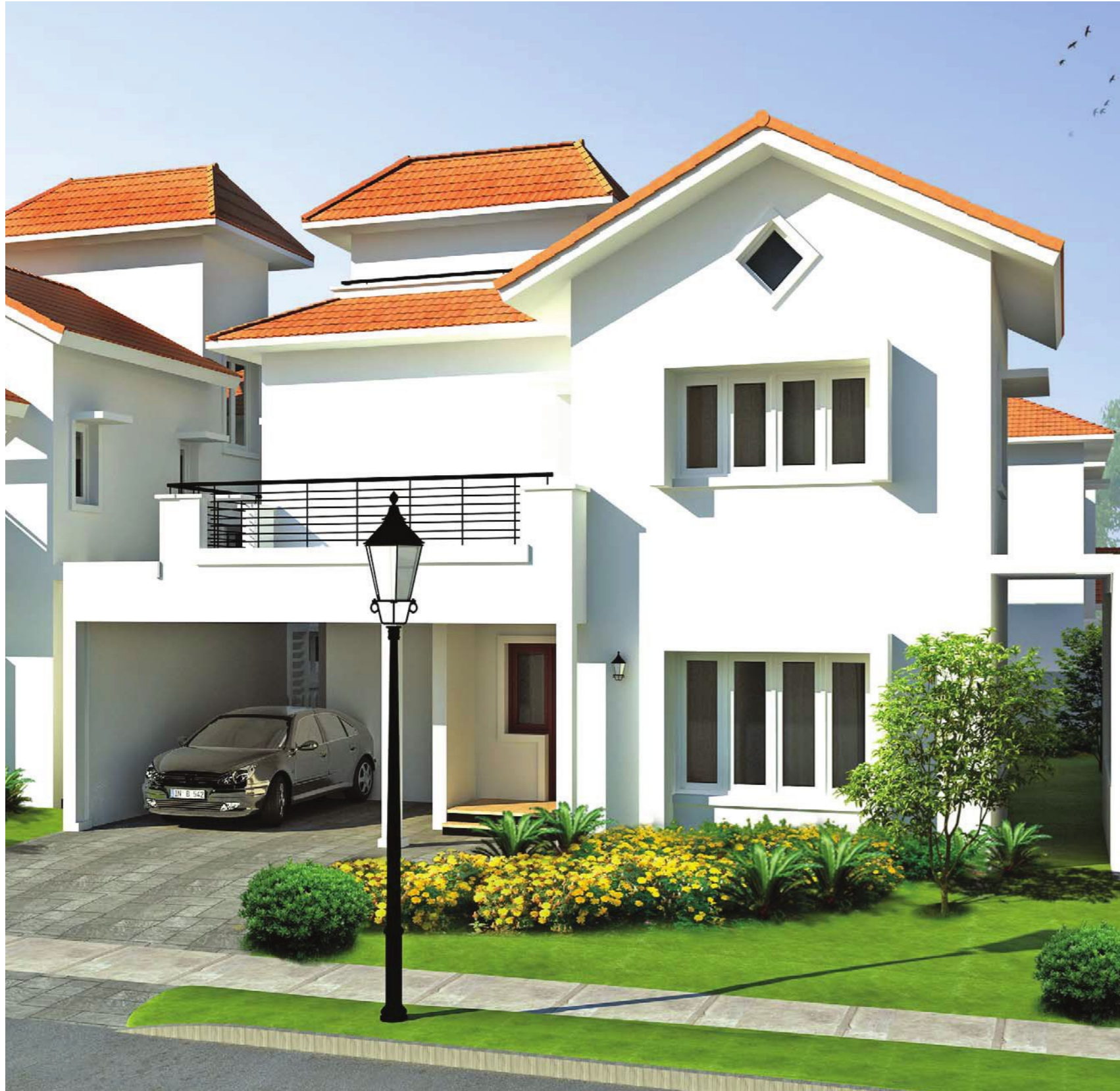
VILLA TYPE B-1