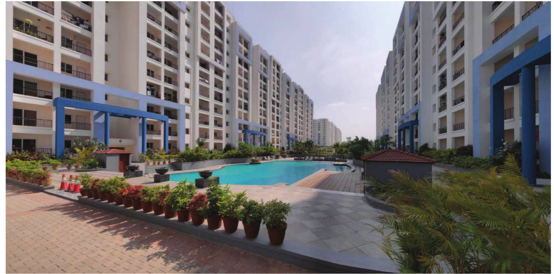
Adarsh Palm Retreat, Gulmohar