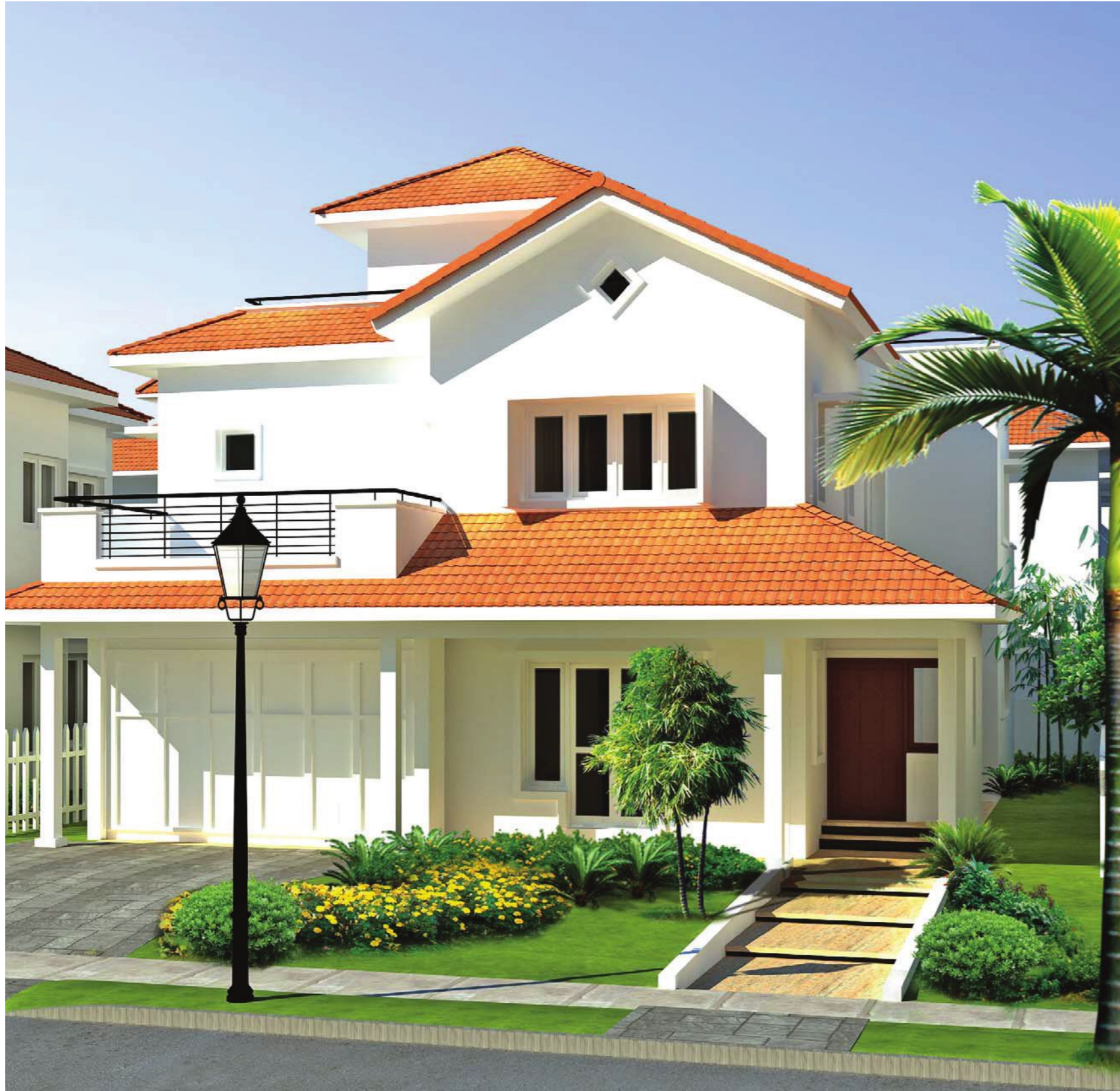
VILLA TYPE A-2