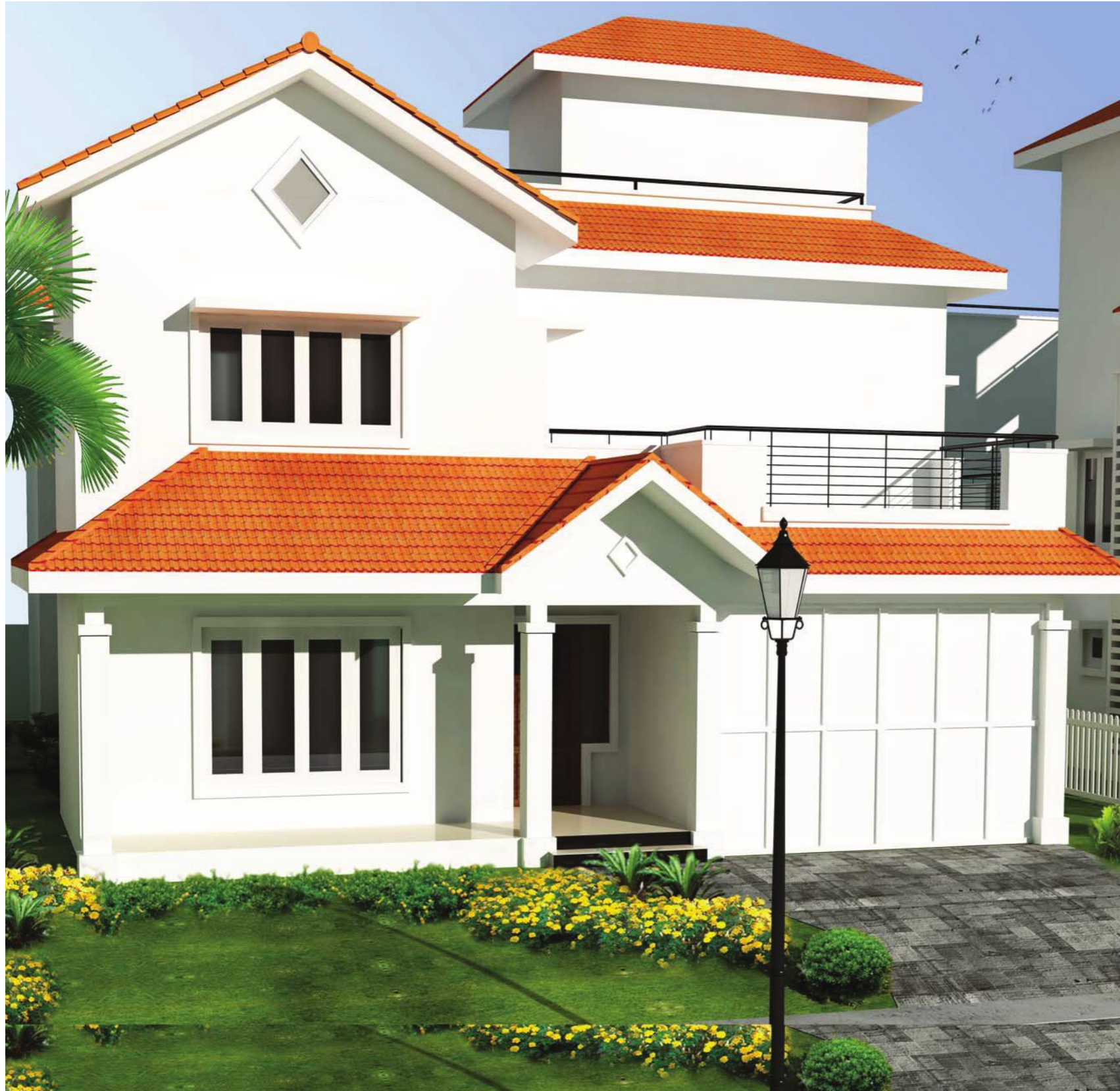
VILLA TYPE A-6