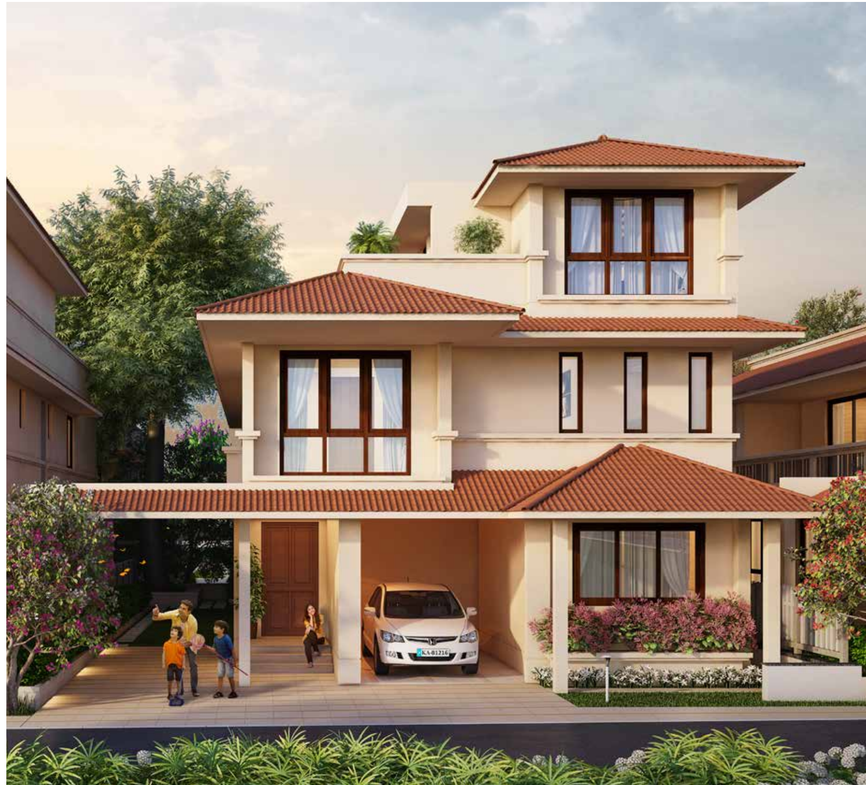
The villa elevation, facade treatment, door & window frames, colour, landscaping, people and car shown are purely indicative and for representation purposes only.

WEST FACING - 45'11" x 75'0" (14M x 22.86M)