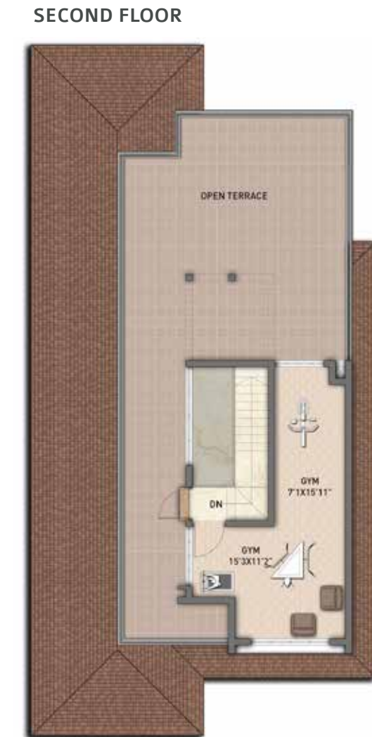
West Facing With Basement