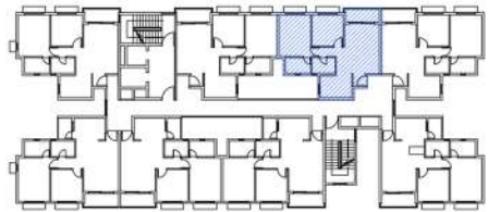
TYPICAL WING PLAN (BLOCK 1 & 2 )